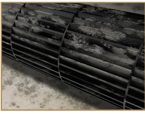
Mini split blower wheel with mold.