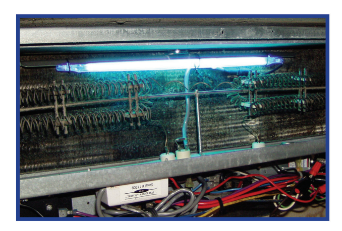
TIGHT-FIT KIT UV™ installed in fan coil unit