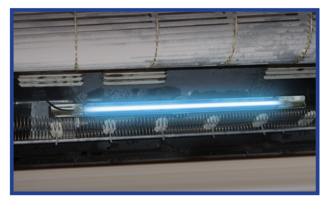
TIGHT-FIT KIT UV™ installed in PTAC unit

An ideal kit for installation into most of the fan coil units and PTACs found on the market today. The kit provides a means for locating the UV light within these units for optimum UV exposure particularly where space is limited.